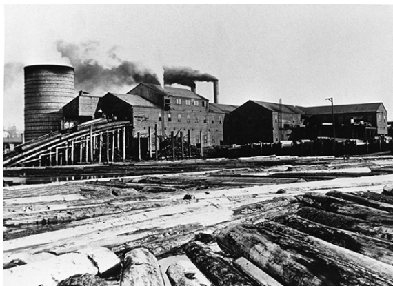
Sawmill, Englewood, B.C., For more information on this photograph, click here.