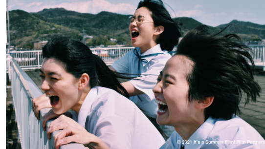
It's a Summer Film! サマーフィルムにのって Sunday, January 28 @ 4:00PM (ET)