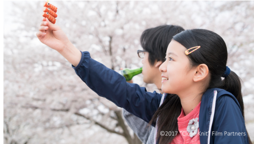
Close-Knit 彼らが本気で編むときは Saturday, January 27 @ 1:30 PM (ET)

Join us this weekend for our annual winter film showcase at Innis Town Hall! Our lineup of soul-stirring films will surely warm your hearts and help lift the winter blues. Co-presented by the Japan Foundation, Toronto and the Consulate-General of Japan in Toronto. A friendly reminder that our headliner film Blue Giant is now fully booked. Rush line will be available, and seats will be released 10 minutes prior to the start of the event.