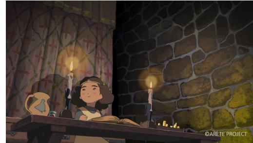
Princess Arete アリーテ姫 Sunday, January 28 @ 11:00 AM (ET)