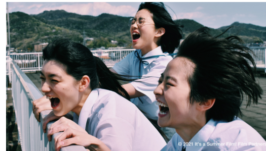
It's a Summer Film! サマーフィルムにのって Sunday, January 28 @ 4:00PM (ET)